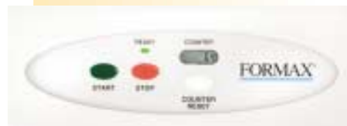
FD 1500 Control Panel

The FD 1500 is built with proven Formax technology. Heavy-duty steel construction offers the dependability and power expected of a larger unit in a smaller package. A processing speed of up to 85 forms per minute enables an operator to complete daily jobs in no time.